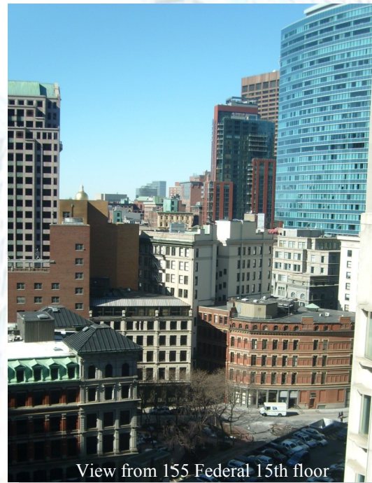
View from 155 Federal 15th floor

155 Federal Street is an eighteen-story building offering easy access to the Expressway, I-93, the Mass Pike and public transportation.